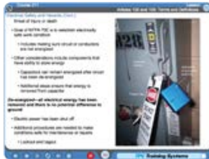
Animations illustrating key points